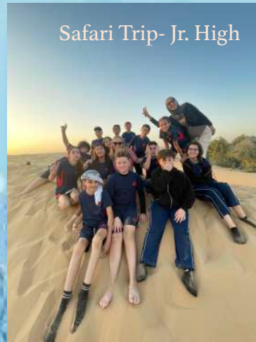
Safari Trip- Jr. High