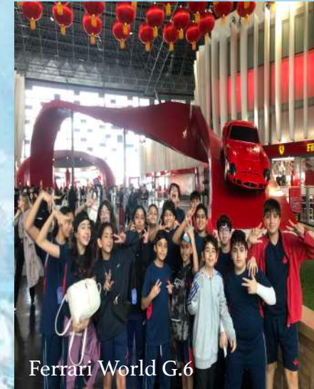
Ferrari World G.6