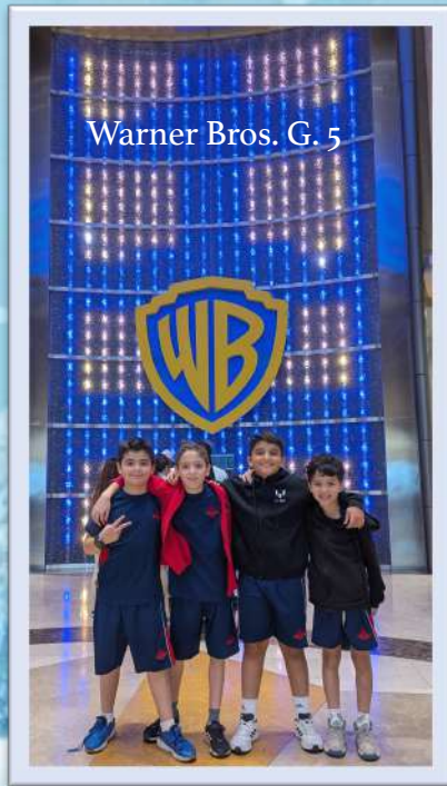
Warner Bros. G. 5