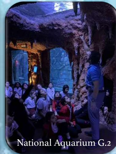
National Aquarium G.2