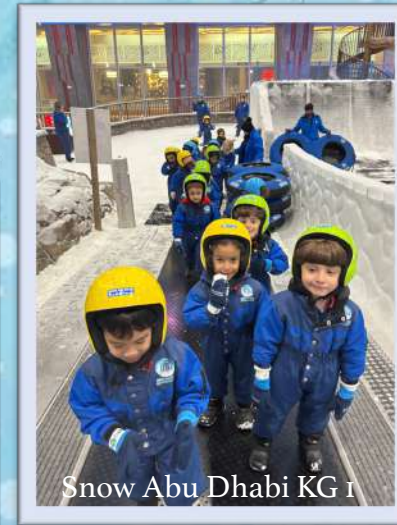
Snow Abu Dhabi KG 1